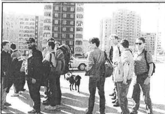
Case study trip