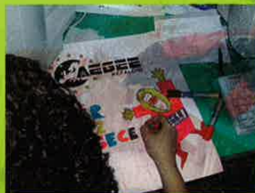
Internal Education: AEGEE ANKARA