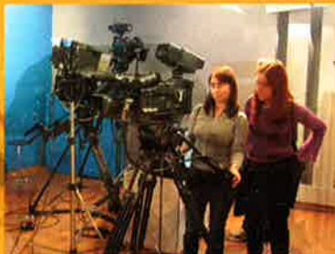
Projects: AEGEE TV