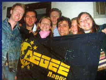
Presents: AEGEE NAPOLI